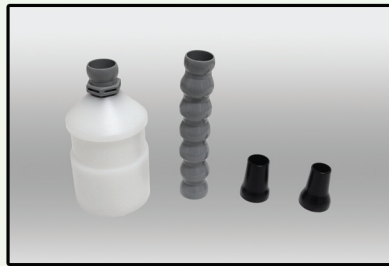
3" 2" NAK002 NAK004