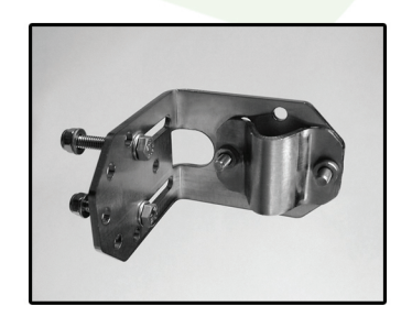
Multi Clamp Base LA00018

Short LA00024 LA00043 LA00044 Medium LA00025 Long LA00026 LA00045