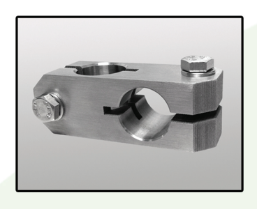
Cross Clamp LA00001

LA00037 Short LA00038 Medium LA00039 Long