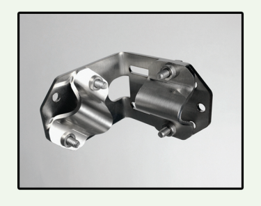
Multi Clamp LA00017