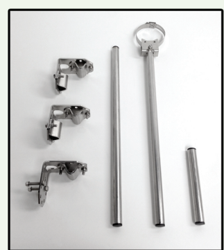
Air Nozzle Kits