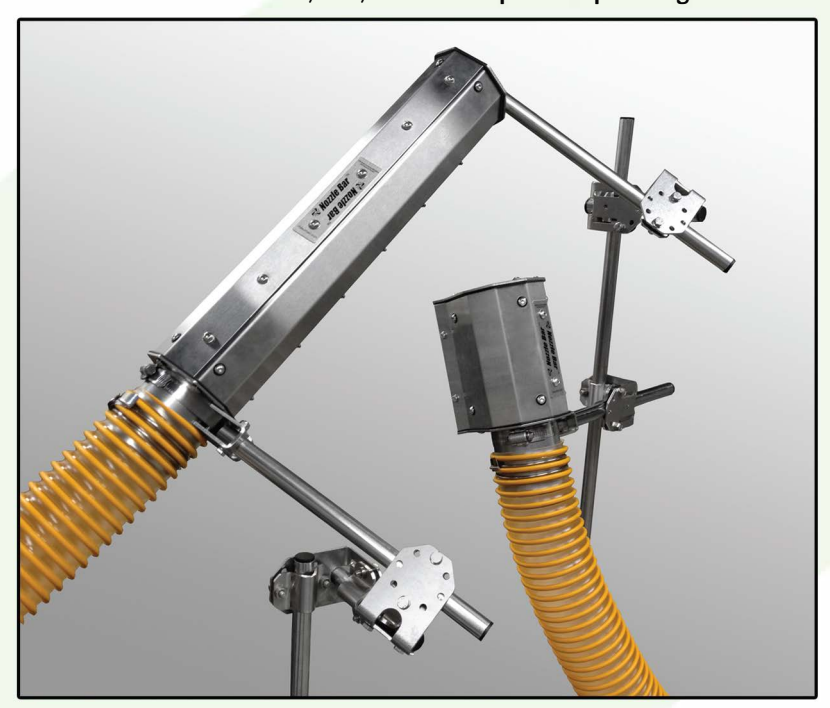
Maximum Performance...... Less Hype.

Maxum LLC P.O. Box 70025 Rochester Hills, MI 48307 Phone: 248, 726, 7110 Fey: 24