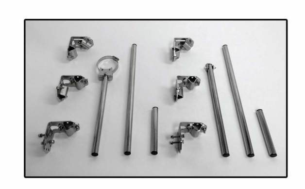
*U.S. Patent #8,814,067. Other patents pending

With the ability to order individual components or pre-made kits, Maxum provides a wide variety of mounting solutions to fully optimize your blow-off system.