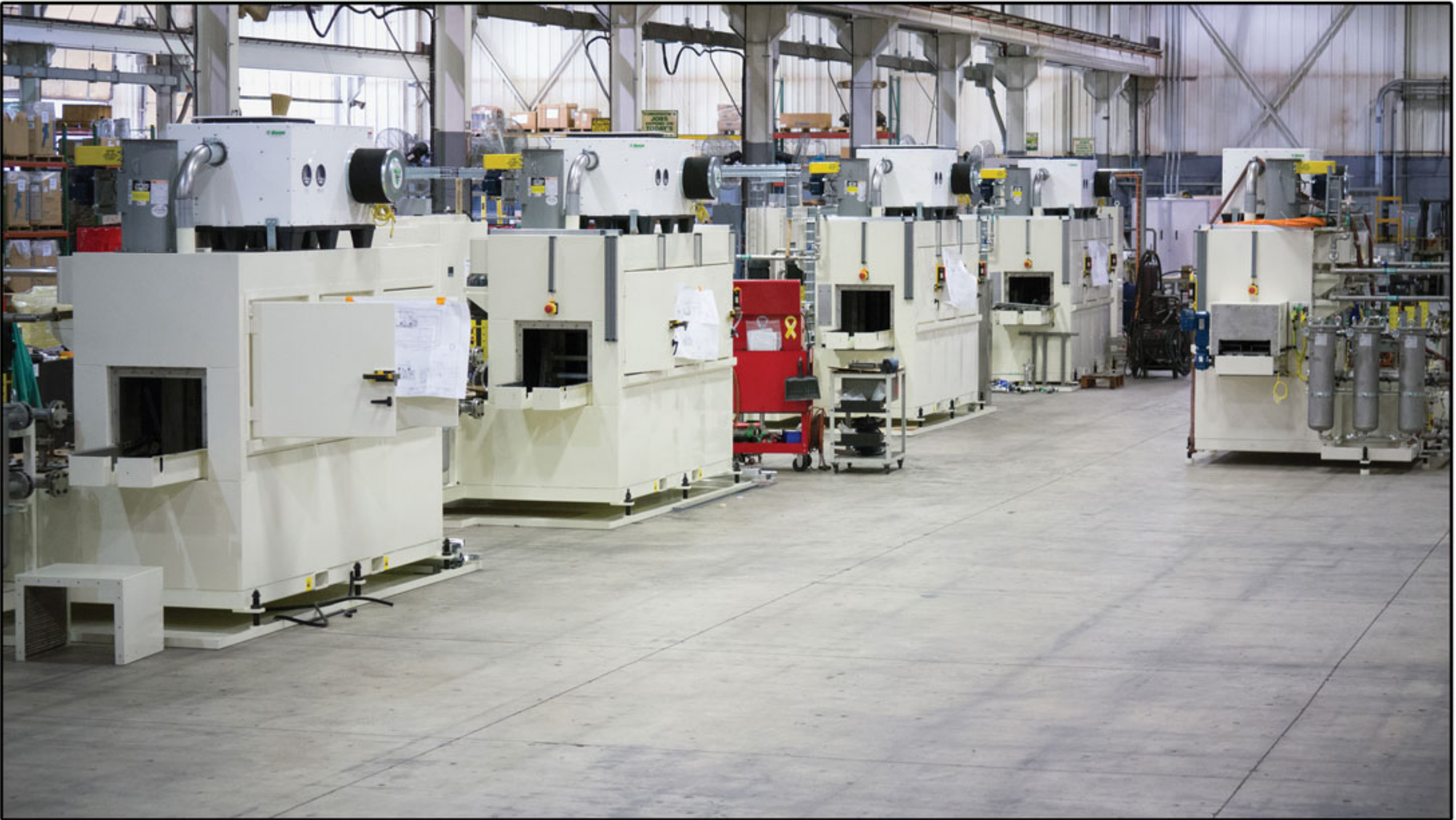
Horizontal “S” Enclosure located on top of parts spray washers.