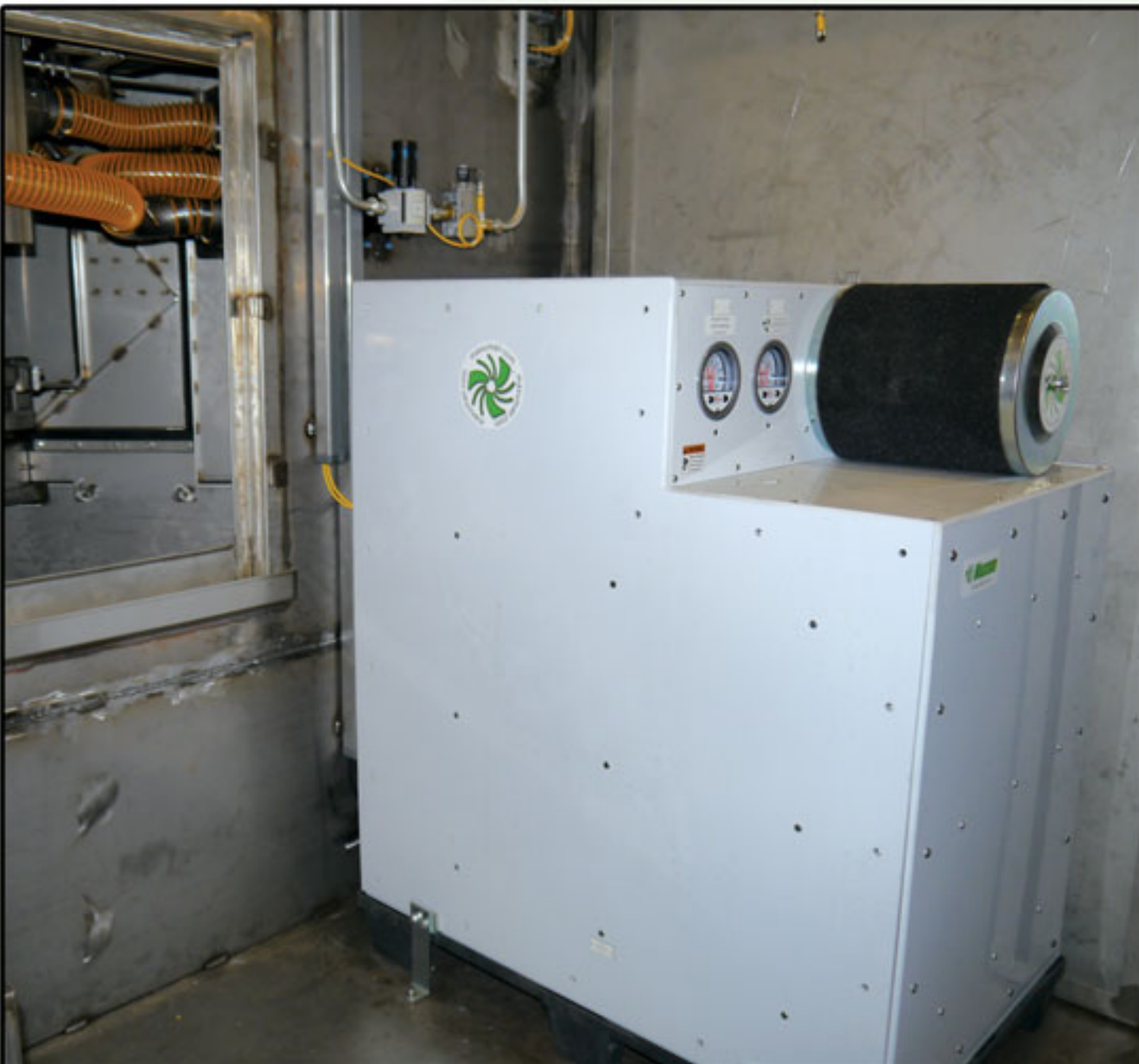
Vertical Enclosure next to wash chamber